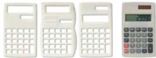
3D printing makes exploring multiple design iterations more efficient and cost-effective.

Both rapid prototyping (RP) and 3D printing technologies build models layer by layer from STL data. The cost